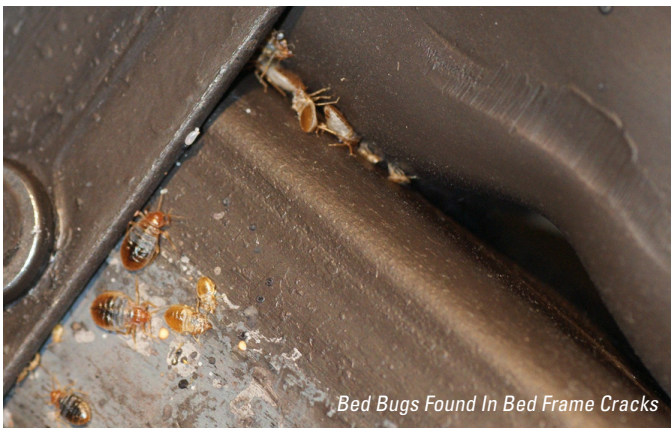
Bed Bugs Found In Bed Frame Cracks

A: Because Bed bugs are small and flat, they are able to squeeze into tiny cracks and crevices on the mattress and box spring, behind headboards, and inside furniture. They prefer to live in groups and are often found in clusters where the adults, nymphs and eggs are together in a protected area.